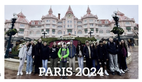
Click on image above to see video

The pupils had an unforgettable trip which gave them a mix of cultural immersion, educational experiences and fun with their friends in the City of Light. Watch the highlights video by clicking on the picture (right).