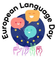
Vittoria , Year 7

Saint Ceciliass' pupils have been busy designing a logo to showcase the importance of learning a language.