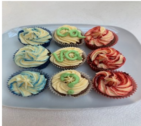
Ca va?' cupcakes are arranged as the French flag Emily , Year 7

Pupils at Saint Ceciliass' have been actively celebrating languages and putting into practice their creativity using their own cultures and identities. See some of the best baking examples below. The winning entry was Emily R in Year 7– well done Emily!