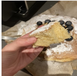
Gwenie S in Year 8 made a traditional Greek cake