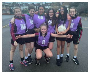
Year 7 A team