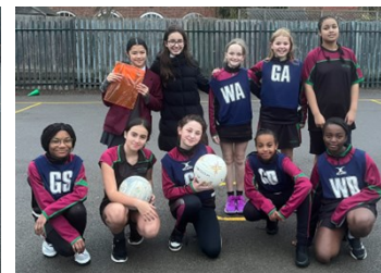
Year 7 B Team