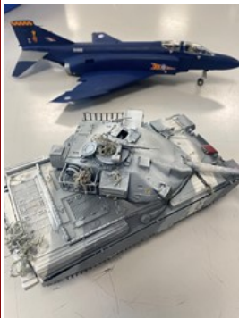
Alan B and Jude B

As part of their 'Conflict and Protest' project, Year 9 pupils have been busy analysing artists including Shepard Fairey, as well as areas of conflict and protest. Their homework was to investigate an area of current or past conflict/protest that interested them and respond creatively. So far, we have received such an inspiring array of creative responses to this task: creative booklets filled with images and details, thoughtful painted canvases, even 3D landscapes and models sensitively put together. These very exciting explorations will now help Year 9 to create their own panoramic final piece based on the theme. Here is a selection of some of the outstanding pieces below.